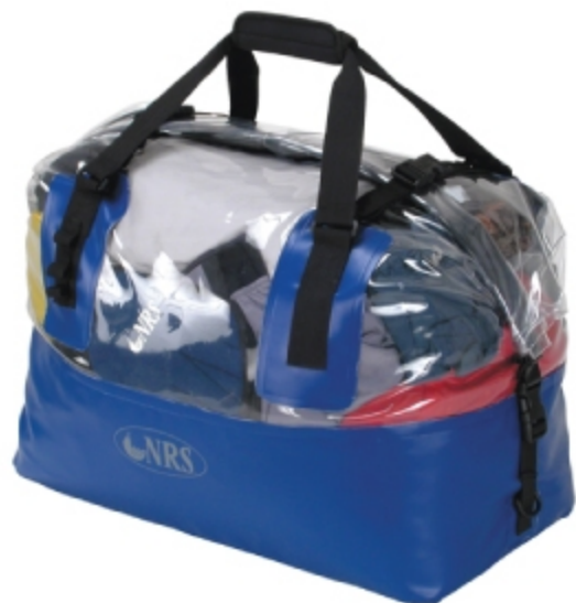
NRS Access Duffel