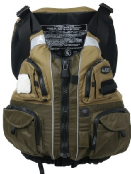
NRS Chinook Fishing PFD