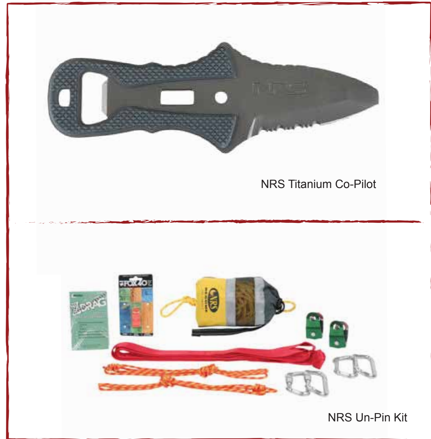
NRS Titanium Co-Pilot