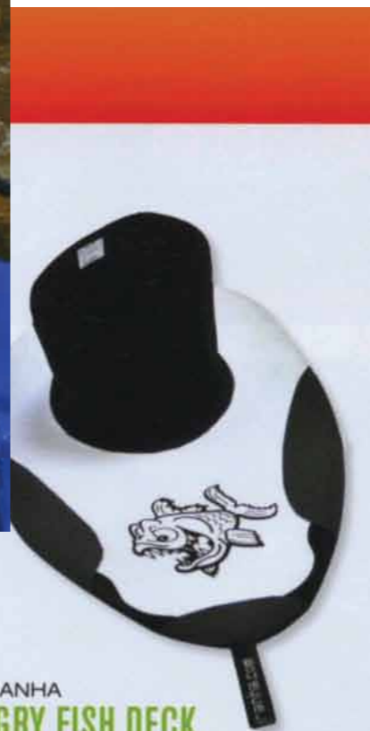
PYRANHA ANGRY FISH DECK www.pyranha.com $149 US

Pyranha enters the spray deck market with the Angry Fish and Grumpy Fish skirts. Aside from the eye-catching rendering of the company's toothy mascot on the deck, the skirt is quite similar to Seals' Shocker, NRS's Drylander or Immersion Research's Shockwave, with one important exception: The Fish comes in two sizes designed for a perfect fit on Pyranha boats (although they can also be used with other manufacturers' boats). The decks are sturdily built with 4-mm neoprene, Kevlar-reinforcing and a tough, easy-on bungee rim.